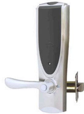
Back of Lock

The DL220 combines fingerprint ID with a keypad system to provide a unique, flexible, keyless system. Regular members can have fingerprints programmed, but friends or short-term visitors can be given individual passcodes to punch in for temporary access, after which their individual codes can be deleted. There are no mechanical keys to distribute, lose or duplicate. The unit also keeps a record for audit trail purposes.